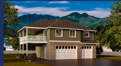
Hip Roof Elevation