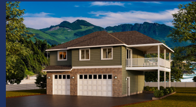
Hip Roof Elevation