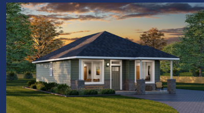
Hip Roof Elevation