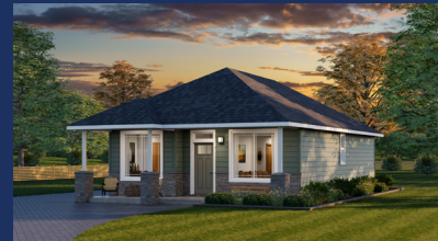
Hip Roof Elevation