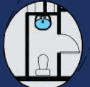
Optional Powder Bath